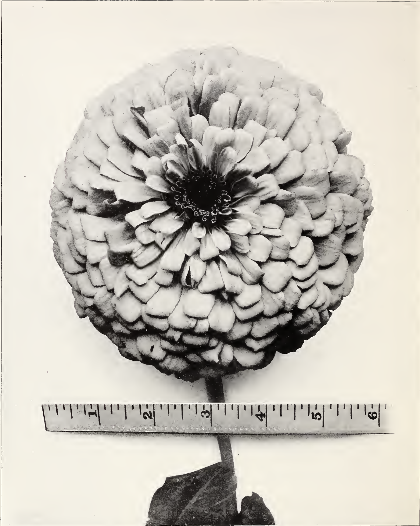
BODGER'S DOUBLE GIANT ZINNIAS